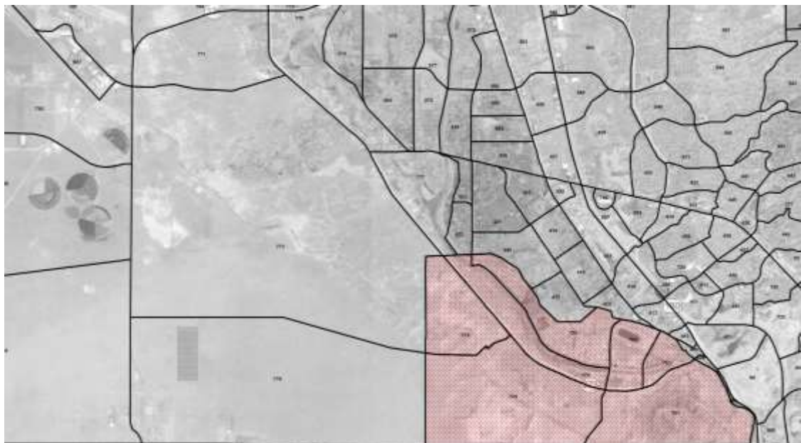
Figure 5: Final TAZ alignment