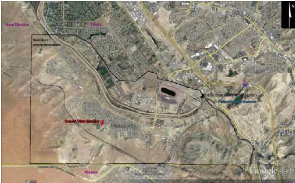
Figure 1: Alternative nonattainment boundary recommendation for the Sunland Park Area.

As part of the Travel Demand Model (TDM) developed for the new Destino 2045 Metropolitan Transportation Plan (MTP) and Destino 2019-2022 Transportation Improvement Program (TIP) for El Paso Metropolitan Planning Organization, the following Traffic Analysis Zones' (TAZ) structure was used for the conformity analysis (Figure 2).